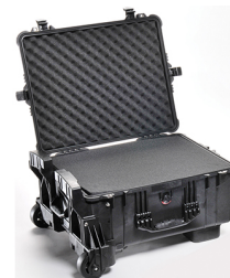
1610MWF With Foam