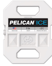
PI-5LB 5lb Ice Pack