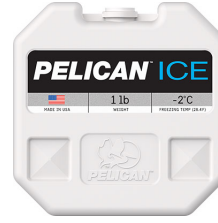
PI-1LB 1lb Ice Pack