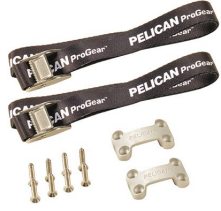
TDKIT Tie Down Kit