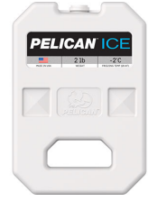
PI-2LB 2lb Ice Pack