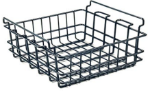
WBSM Dry Rack Basket