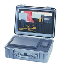
1509 Lid Organizer