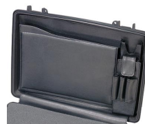
1498 Computer Lid Organizer