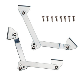
KIT-LIDSTAY-CARGO Cargo Lid Stays