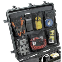
1699 Lid Organizer