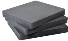
1692 Pick N Pluck™ Sections Only (set of 3)