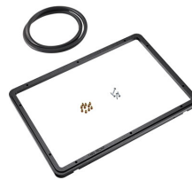
1450PF Special Application Panel Frame