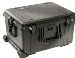
1620NF No Foam