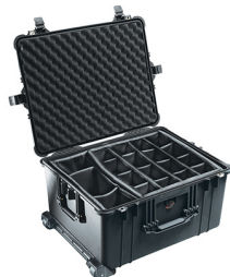
1624 With Padded Dividers