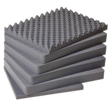
1621 6 pc. Replacement Foam Set