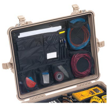
1609 Lid Organizer