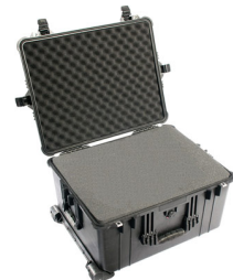
1620WF With Foam