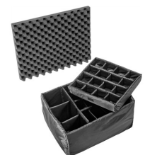
1625 Padded Divider Set