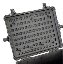
1610MP EZ-Click™ MOLLE Panel