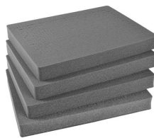
1622 Pick N Pluck™ Sections Only (set of 4)