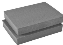
1562 Pick N Pluck™ Sections Only (set of 2)