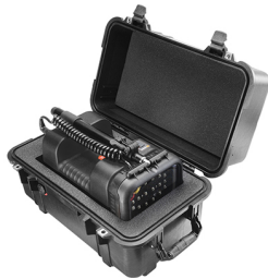
1460AALG With Custom Foam for 9430 / 9435