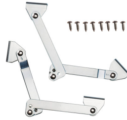
KIT-LIDSTAY-CARGO Cargo Lid Stays