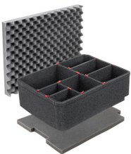
iM2720TPKIT TrekPak Case Divider Kit