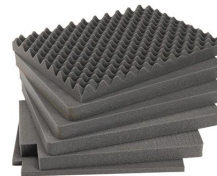
iM2720-FOAM 5 pc. Replacement Foam Set