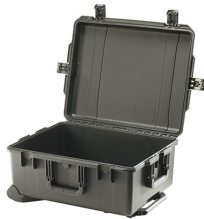
iM2720-X0000 No Foam