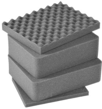
iM2075-FOAM 4 pc. Replacement Foam Set