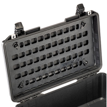
1535MP EZ-Click™ MOLLE Panel