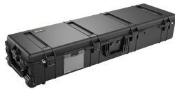
1770NF No Foam