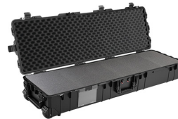
1770WF With Foam