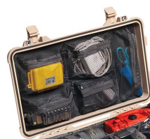
1519 Lid Organizer