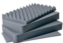
1511 4 pc. Replacement Foam Set