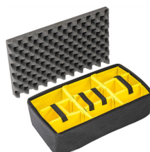
1515 Padded Divider Set