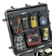
1699 Lid Organizer