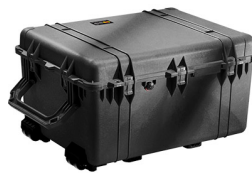
1630NF No Foam