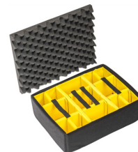
1555 Padded Divider Set