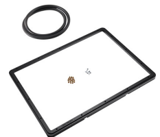
1550PF Special Application Panel Frame