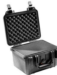
1300WF With Foam