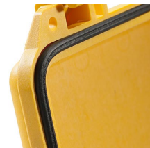
1723 Replacement O-ring