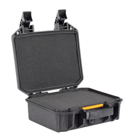
V100WF With Foam