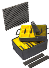
1607AirDS Padded Divider Set