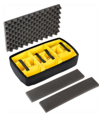
1535AirDS Padded Divider Set