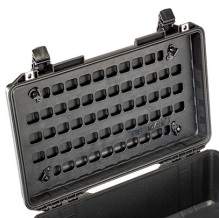
1535MP EZ-Click™ MOLLE Panel