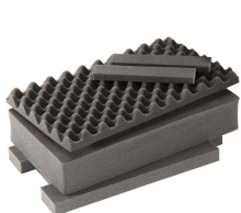
1535AirFS 3 pc. Replacement Foam Set