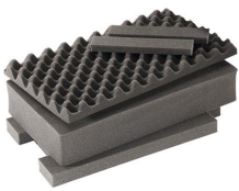
1535AirFS 3 pc. Replacement Foam Set