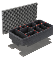
1535TPKIT TrekPak Case Divider Kit