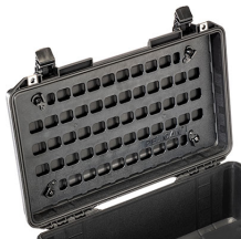
1535MP EZ-Click™ MOLLE Panel