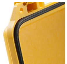
1623 Replacement O-ring