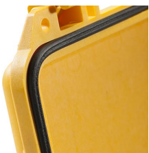
0343 Replacement O-ring