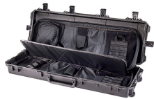
472-PWC-DW3200-BLK-BLK Black Case With Black Soft Case