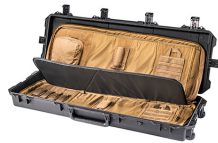
472-PWC-DW3200-BLK-COY Black Case With Coyote Soft Case