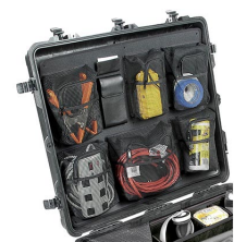
1699 Lid Organizer