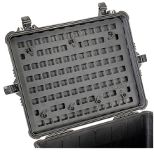
1610MP EZ-Click™ MOLLE Panel