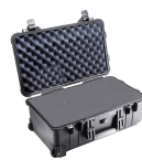
1510WF With Foam