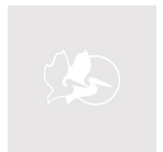
1510PDL Padded Dividers with Mesh Lid Organizer