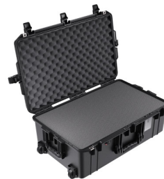
1595WF With Foam