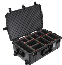
1595TP With TrekPak Divider System