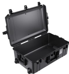
1595NF No Foam