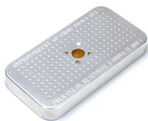
1500D Desiccant Silica Gel