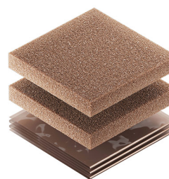
1500CI Corrosion Intercept Kit