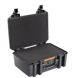
V300WF With Foam