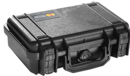
1170NF No Foam