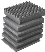
iM2275-FOAM 4 pc. Replacement Foam Set