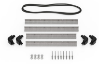
iM2275-BEZEL-LID Lid Bezel Kit