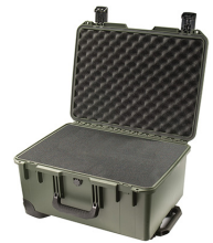
iM2620-X0001 With Foam