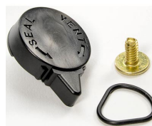
iM-VALVE-M-B Manual Purge Valve