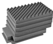
iM2620-FOAM 6 pc. Replacement Foam Set