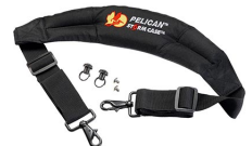
iM-STRAP-S-VER2 Padded Shoulder Strap