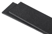
iM2620TPDIV Extra TrekPak Dividers