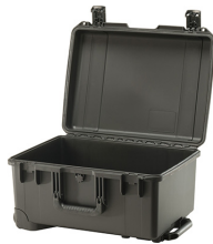
iM2620-X0000 No Foam