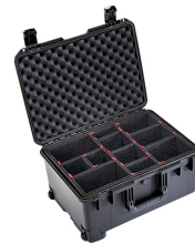
iM2620-X0006 With TrekPak Divider System