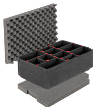
iM2620TPKIT TrekPak Case Divider Kit