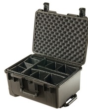
iM2620-X0002 With Padded Dividers