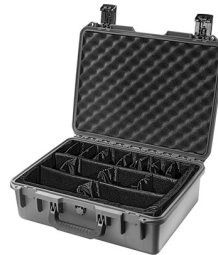
iM2400-X0002 With Padded Dividers