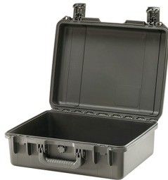
iM2400-X0000 No Foam