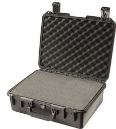
iM2400-X0001 With Foam