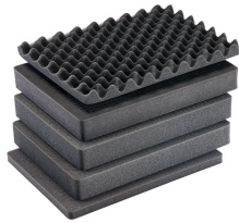
1557AirFS 3 pc. Replacement Foam Set