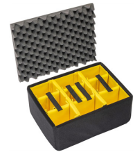
1557AirDS Padded Divider Set