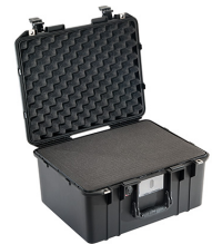
1557WF With Foam