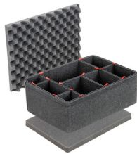
1557TPKIT TrekPak Case Divider Kit