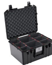
1557TP With TrekPak Divider System