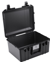
1557NF No Foam