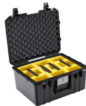
1557WD With Padded Dividers