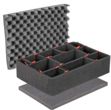
1520TPKIT TrekPak Case Divider Kit