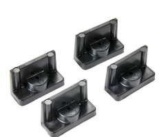
1507 Quick Mounts - set of 4