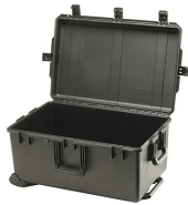
iM2975-X0000 No Foam