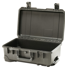
iM2500-X0000 No Foam