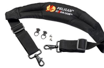
iM-STRAP-S-VER2 Padded Shoulder Strap