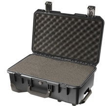
iM2500-X0001 With Foam