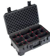
iM2500-X0006 With TrekPak Divider System