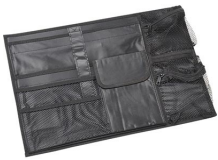
iM2500-UTILITYORG Utility Organizer