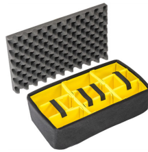
iM2500-DIV Padded Divider Set