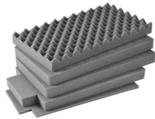
iM2500-FOAM 5 pc. Replacement Foam Set