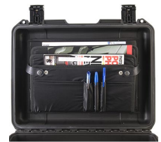
iM24XX-LIDORG Lid Organizer