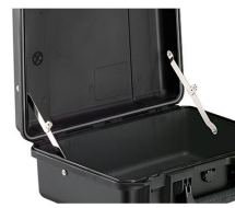
iM-LIDSTAY Lid Stay