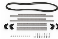
iM2450-M4-BEZEL-L Lid Bezel Kit (Metric)