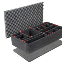
1605TPKIT TrekPak Case Divider Kit