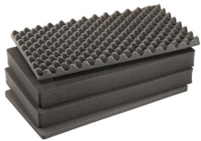
1605AirFS 4 pc. Replacement Foam Set