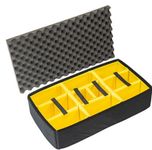
1605AirDS Padded Divider Set