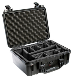
1454 With Padded Dividers