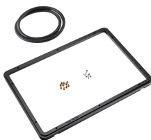
1450PF Special Application Panel Frame