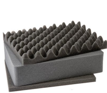
1451 3 pc. Replacement Foam Set

Master Pack 4 Nameplate yes Military yes