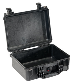
1450NF No Foam