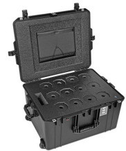
WINE-12B 12-Bottle Wine