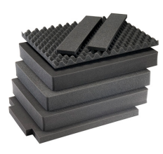
1637AirFS 7 pc. Replacement Foam Set

23215 Early Ave • Torrance, CA 90505 USA • Phone: (310) 326-4700 • (800) 473-5422 • Fax: (310) 326-3311 sales@pelican.com • www.pelican.com