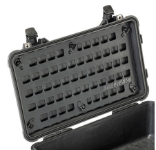
1510MP EZ-Click™ MOLLE Panel