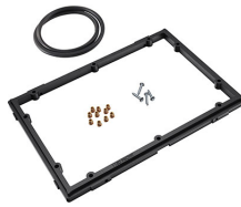
1150PF Special Application Panel Frame