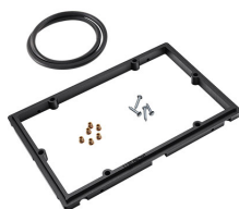
1120PF Special Application Panel Frame