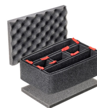
1120TPKIT TrekPak Case Divider Kit