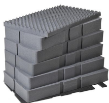
0501 7 pc. Replacement Foam Set