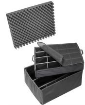
1645 Padded Divider Set