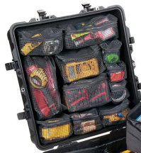
0379 Lid Organizer